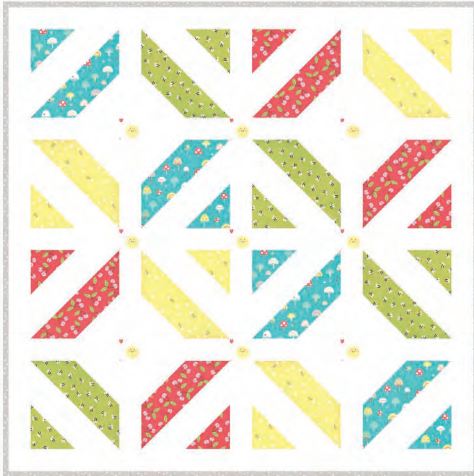
It's Sew Emma ISE 529 Little P - Rainbow Bright - 42" x 42"