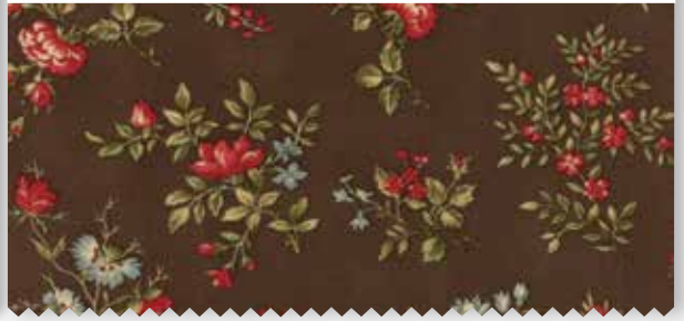
44184 13 *