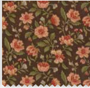
44186 13 *